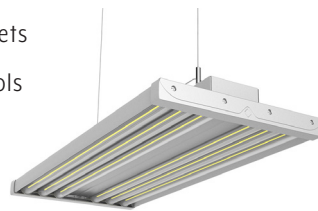
REPLACE FLUORESCENT BULBS